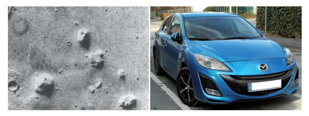
Figure 1.1 The "face on Mars" and a "smiling" Mazda 3.

Where does all of this leave us? Hopefully, you now have a new-found realization that much of the information that bombards us every day is based on some rather popular but questionable ways of knowing what we know. Many of our most familiar and comfortable ways of knowing may be fast and easy or logically appealing - they are in our comfort zones. But we need also appreciate that they can be risky, error-prone ways of knowing. Traditional and authoritative knowledge, common sense and intuition are all alike in that they encourage an uncritical acceptance of information. Ideas that have been around a long time, ideas that are presented by authorities, ideas that are practical or "feel right" can wind up being accepted as true even when they are false. Pure rationalism, while featuring the power of logical reasoning can, nonetheless, lead to erroneous conclusions if major and minor premises are factually incorrect. Strict empiricism can also mislead us if we are not careful about obtaining the "full" or non-distorted picture of what it is we are "seeing" (or "hearing," tasting," "touching," or "smelling"). Still, we need not despair; there is one way of knowing that is distinctively different from those we have just reviewed: science. Science and its research methods promote a critical assessment of information before that information is accepted as accurate.